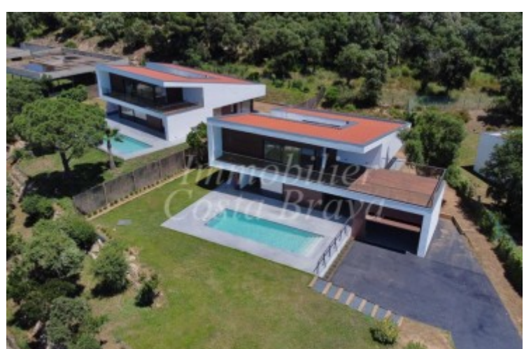
See more information about this property on our website