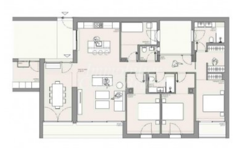
See more information about this property on our website