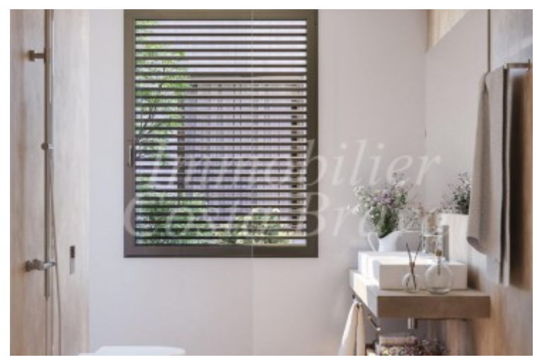
See more information about this property on our website