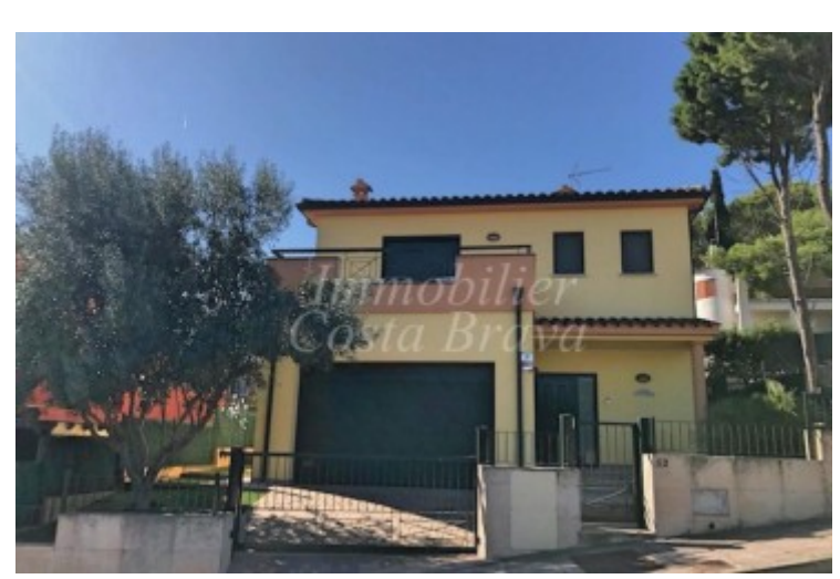
See more information about this property on our website