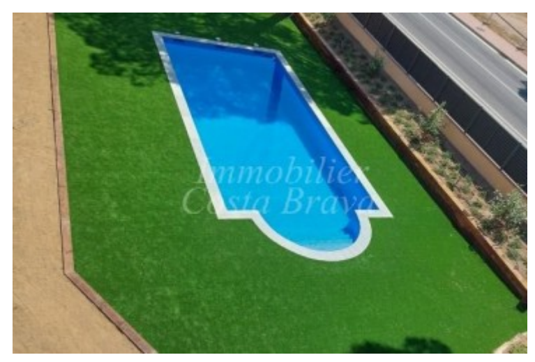
See more information about this property on our website