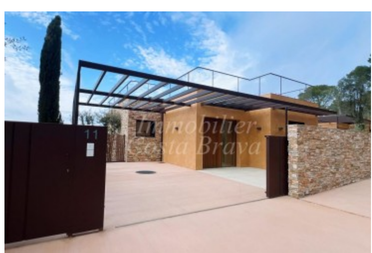
See more information about this property on our website